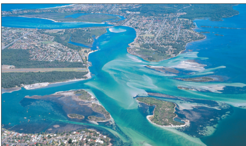
Aerial view of Swansea Channel

In the first half of the last century, similar engineering approaches were used elsewhere to improve estuaries that were stressed due to accelerated sediment and nutrient stormwater runoff. In most cases, however, the result has been very disappointing and at times disastrous. Such a large intervention on a complex system results in many negative flow-on consequences.