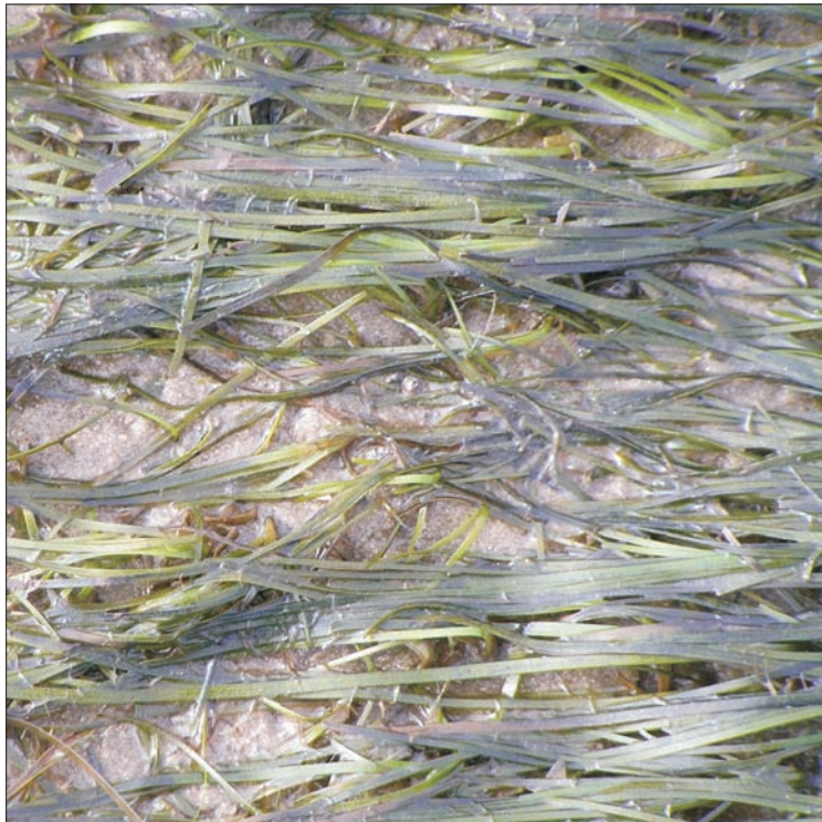
Zostera sp. exposed at low tide

The roots and rhizomes of seagrasses help stabilise sediments in the beds of coastal lakes and embankments, as well as trapping and recycling nutrients. Their leaves provide shelter, food and protection to many organisms, as well as an additional source of detritus. Seagrass leaves also act as a filter, slowing overlying water and thus allowing any sediment that is suspended in the water to fall out into the seagrass meadow. This in turn improves water clarity.