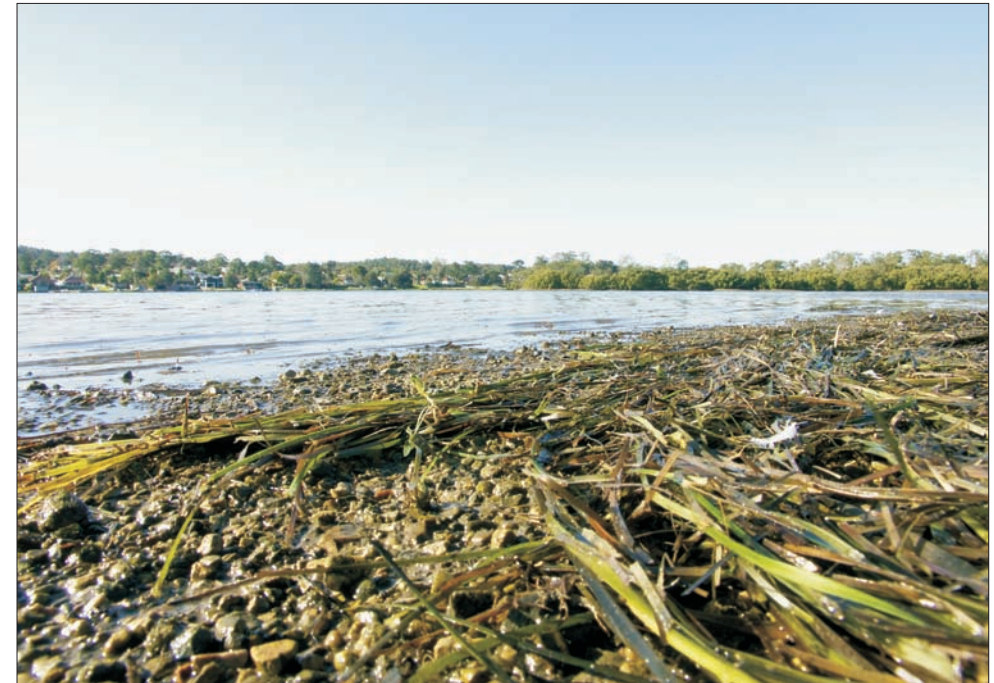
Seagrass wrack washed up on shore at Blackalls Park

Seagrass wrack is harvested for a variety of uses throughout Australia and overseas including use as a soil improver and/or garden mulch.